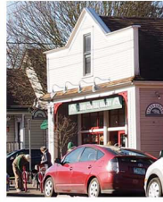
13 - Great Harvest