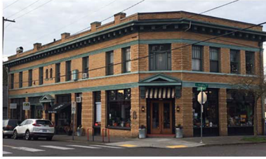
1 - Special Building not on National Historic register

Learn about common streetcar-era "design patterns" found in Sellwood-Mooreland and throughout Portland. Some newer buildings may relate better to neighborhood character than others by integrating design elements found locally. These patterns can help any style of building fit better with local context and create density with sensitivity.