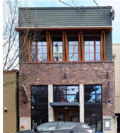
14 - Salon - Recent construction with good context context-sensitive design