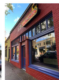
22- Acena + Sunny's Pizza Streetcar-era buildings with examples of common storefront patterns and chamfered corner entries