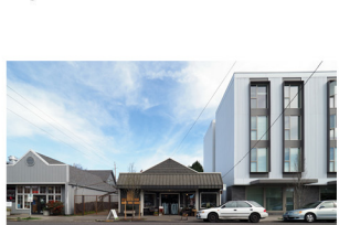
11 - (2017) Recent construction with less context-sensitive design