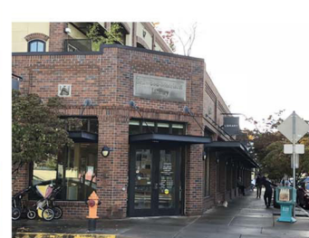
18 - Library Newer construction with pedestrian-oriented context-sensitive design + stepbacks