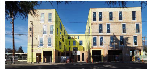
20 - (2018) Recent construction with good courtyard but less context-sensitive design