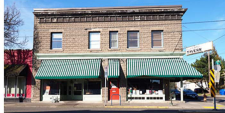
9 - Gino's