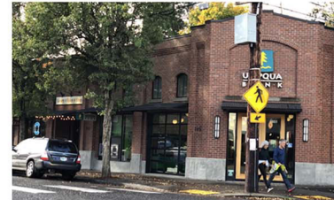
17-Umpqua Bank - Context-sensitive new construction